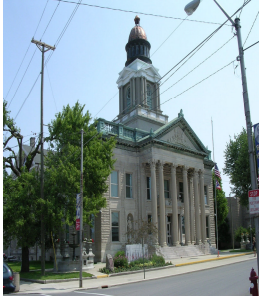
CRAWFORD COUNTY COURTHOUSE