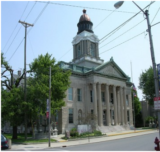
CRAWFORD COUNTY COURTHOUSE